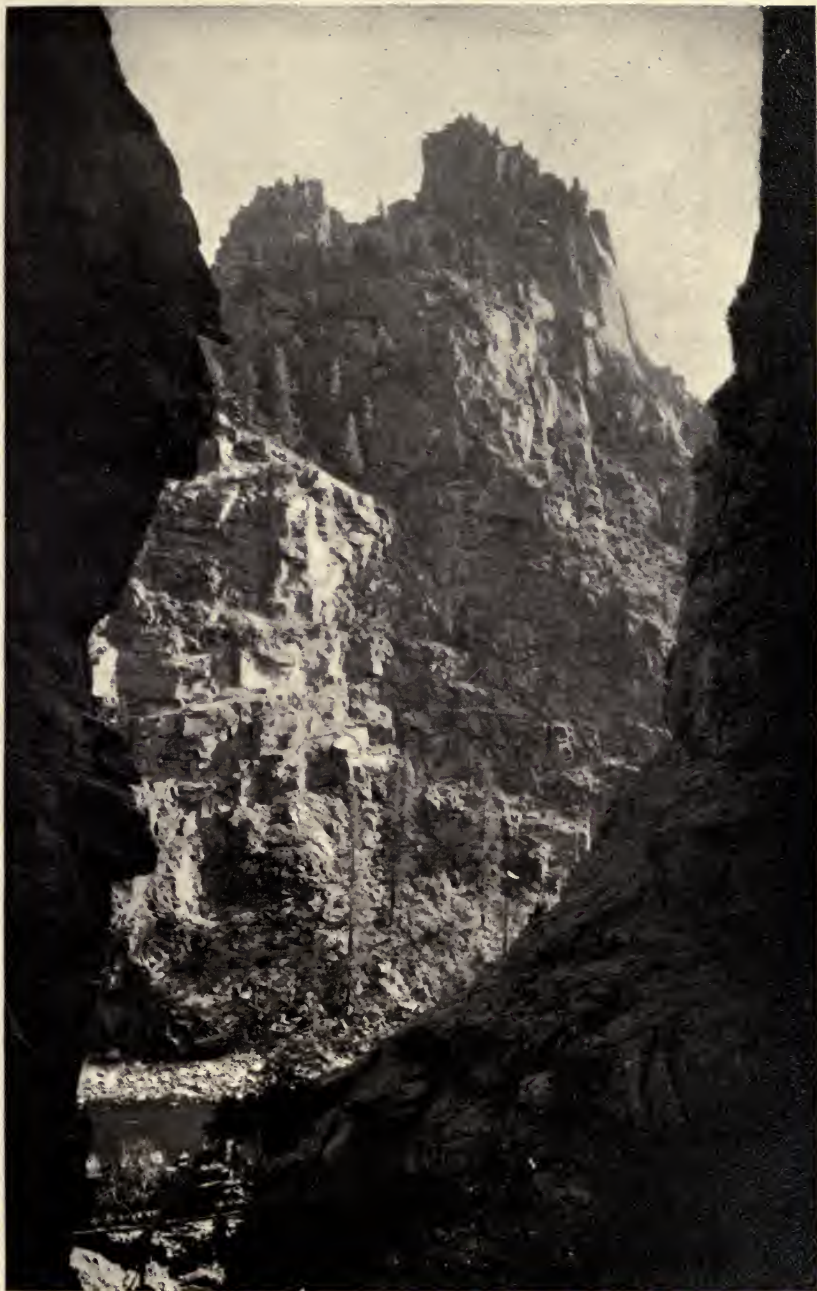
BLACK CANON OF THE GUNNISON SIDE VIEW SHOWING THE CURRECANTI NEEDLE